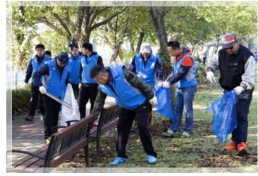
<“One Company, One River” restoration campaign>