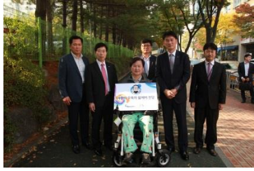
<Roly-poly Wheelchair of Love>