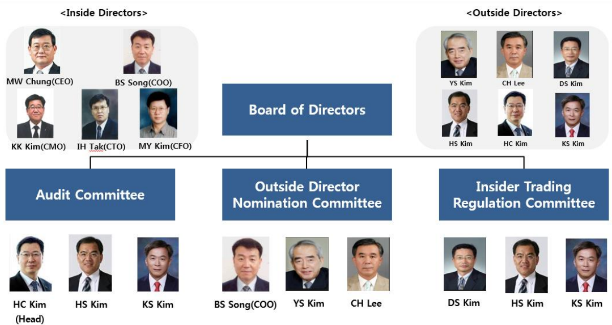
<Table 2. Committee Members>