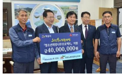
<Scholarship for Young Tree of Hope Project>