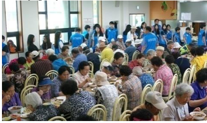
<Helping elderly people living alone>