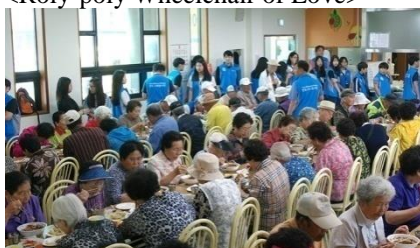
<Helping elderly people living alone>