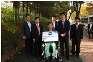
<Roly-poly Wheelchair of Love>

Fourth is environmental conservation. The Company has played a major role in cleaning the mountains and rivers near each of its business headquarters and is actively participating in nature conservation campaigns conducted by the government as it takes the lead in preserving nature. Major activities include the "one company one river" and "one company, one mountain" restoration campaigns and a drive toward low-carbon green management, garbage cleanup and energy conservation.