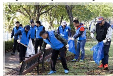
<"One Company, One River" restoration campaign>