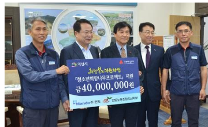
<Scholarship for Young Tree of Hope Project>